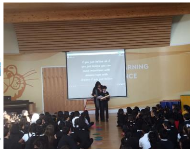
Attendance Competition Winning Poster and Child!

This month, children who have worked hard to improve their attendance, have been able to take part in a 'Cookie Decorating Experience'. It was a huge success, and the children really enjoyed it!